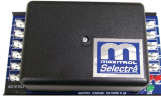
Figure 1. Replacement Maxitrol Amplifier