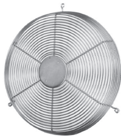
Blower Inlet Guard Assembly

NOTE: The blower inlet guard and belt guard assemblies (see Figure 1 ) together are option CD10. The blower inlet guard assembly when ordered separately is option CD12.